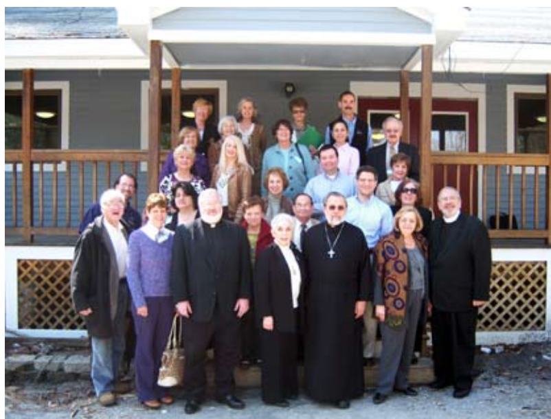
Lenten Retreat Participants St. Methodios Faith & Heritage Center, Contoocook, NH