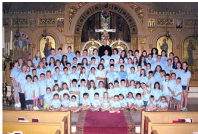
2009 Vacation Church Camp Transfiguration Church, Lowell, MA