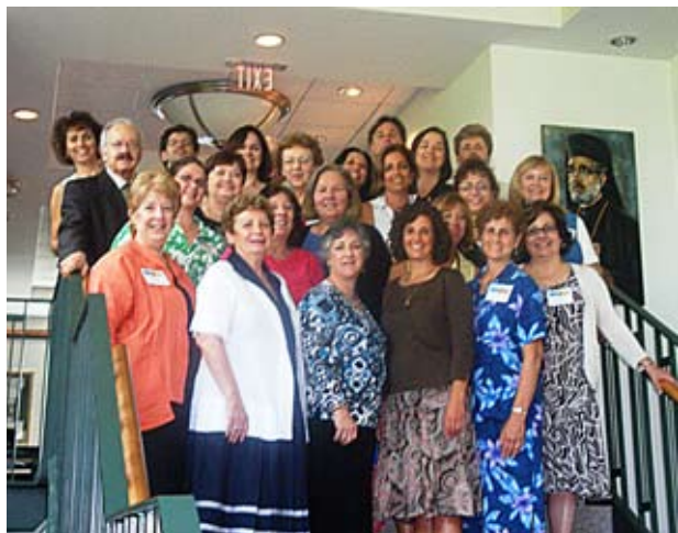
National Church Music Institute Participants Archbishop Iakovos Library, Brookline, MA

Church School Teachers, Youth Music Coordinators, Clergy, Youth Ministry Coordinators and others interested in hymnology programs for our youth gathered from throughout the Archdiocese at Hellenic College/Holy Cross School of Theology in Brookline, MA in late July for a Summer Institute: Focus on Youth Music . The program was sponsored by the National Forum of Greek Orthodox Church Musicians with a generous grant from Leadership 100 and in conjunction with the Department of Religious Education.