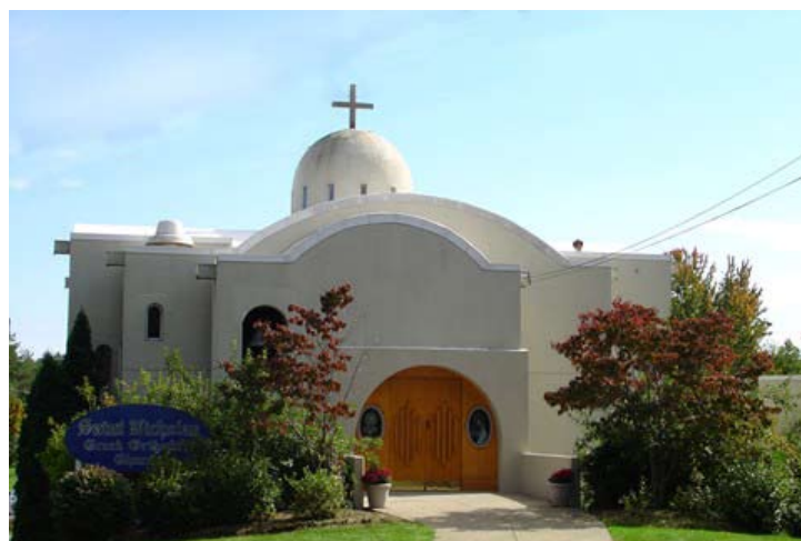
St. Nicholas Church, Portsmouth, NH

Please save the date and make plans to attend this once-in-a-lifetime Conference!