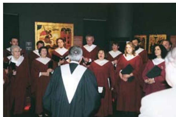
Annunciation Choir of Newburyport, MA

The Choir of the Annunciation Greek Orthodox Church in Newburyport, MA recently performed a concert of sacred Orthodox hymns from the Greek and Russian traditions at the Museum of Russian Icons in Clinton, MA. This renowned museum is home to more than 300 icons from Russia and it recently hosted a rare exhibit of icons from the famed Tretyakov Gallery in Moscow. At the invitation of the museum, the choir performed sacred works on the last night of the exhibit, a farewell to these magnificent icons before their return to the museum in Moscow. The choir was thrilled to perform sacred hymns for the icons, most of which have not been in churches for more than 75 years. The choir's repertoire includes a number of major hymns by Russian composers including the living Russian Orthodox composer, Rev. Sergei Glagolev. Fr. Glagolev's work spans more than 50 years of composing and includes hymns for Divine Liturgy and the many feasts of Orthodoxy. The choir wishes to thank the Museum of Russian Icons for hosting this concert.