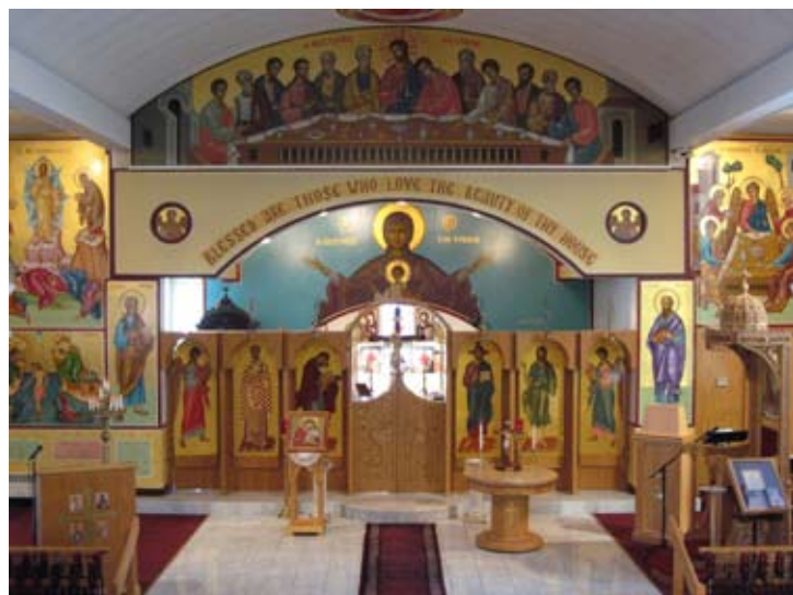
St. Nicholas Church, Portsmouth, NH