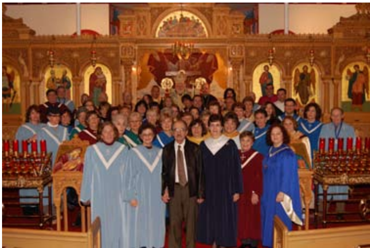
MBFGOCM Conference Choir, Haverhill, MA

PLEASE SEND YOUR COMPLETE ROSTER OF ALL CHOIR MEMBERS, INCLUDING ORGANISTS AND DIRECTORS, SHOWING THE TOTAL NUMBER OF YEARS OF SERVICE, BEGINNING IN YOUTH CHOIR (if applicable) THROUGH JUNE 2009, FOR EACH PERSON TO CAROL SALVO, 12 ROBINHOOD ROAD, WINCHESTER, MA 01890 OR E-MAIL TO bcjas@comcast.net .