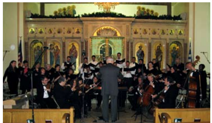
MBFGOCM Christmas Concert Choir, Boston, MA