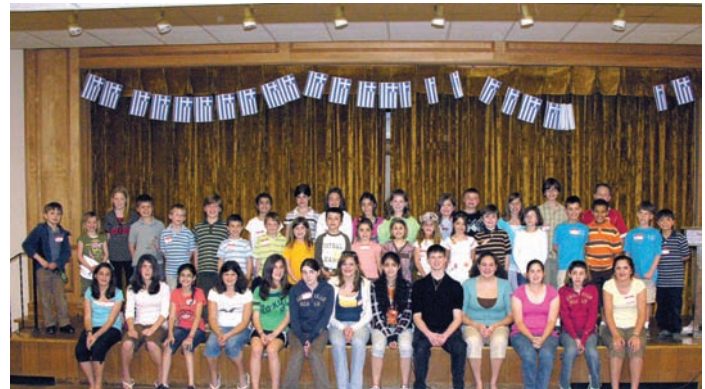
Lowell, MA - Holy Friday Youth Retreat

The CMI will feature topics such as: Ways to improve conducting techniques; Enhancing the choir's tone; Attracting new members and retaining old ones; Understanding the liturgy and the demands of a hierarchical liturgy; Working with youth and much more. Please also note that the date for the CMI has changed and will be held on Saturday, September 27, 2008 at the Archbishop Iakovos Library and Research Center at Hellenic College/Holy Cross School of Theology in Brookline, MA. Look for more information in upcoming newsletters. We look forward to seeing you all there!