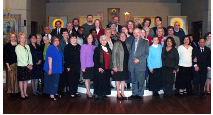
Pan Orthodox Choir - Sunday of Orthodoxy St. Sava Serbian Orthodox Church - Cambridge, MA

Pan Orthodox Vespers Services were held in various locations around the Metropolis of Boston on March 16. At St. Sava Serbian Church in Cambridge, a pan Orthodox choir comprised of approximately 40 members of the Serbian, Greek, Antiochian, Bulgarian and Russian (OCA) churches chanted the church hymns. In western Massachusetts, a combined choir sang the responses at St. George Cathedral of Springfield, which hosted the area's Orthodox churches. In northern Massachusetts, the newly-established Youth Choir (19 voices!) and a combined Senior Choir alternately sang the responses at St. George Church in Lynn. In Rhode Island, the Assumption Church of Pawtucket hosted local Orthodox churches and the combined choir chanted in Greek, English and Russian. Food and refreshments followed at each location.