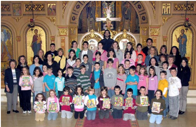
Lowell, MA