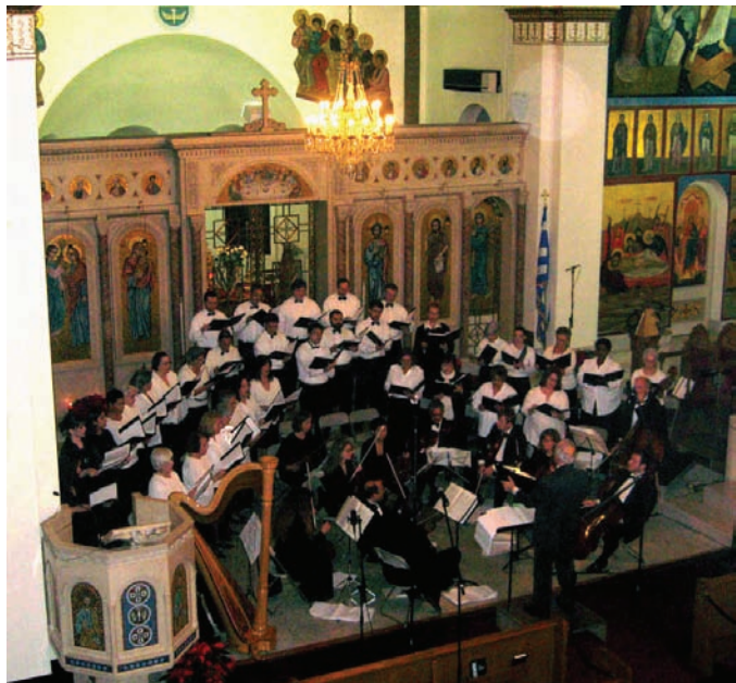
2007 MBFGOCM Christmas Concert Choir - Boston, MA