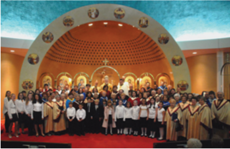
MBFGOCM Conference 2007 Choir - Cranston, RI