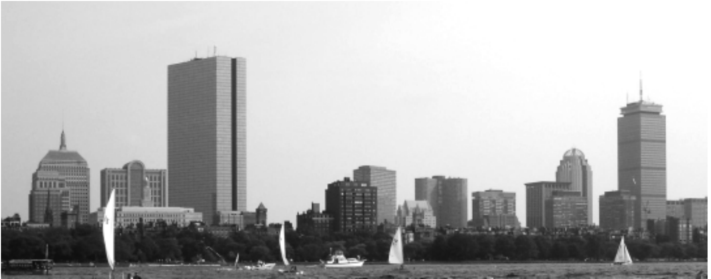
The Beautiful Skyline of Boston's Back Bay