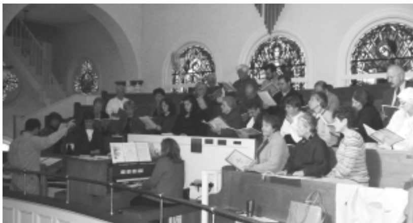
Conference Area Rehearsal at St. Vasilios Church, Peabody, MA